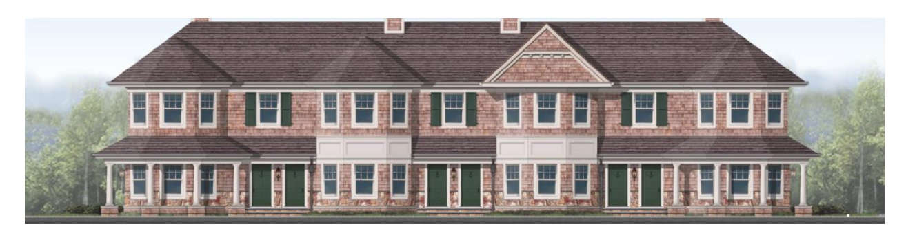
Middle Country Meadows Rendering

Economic Impacts are estimated to be 152 direct, on-site construction jobs, 88 indirect jobs, totaling 240 construction-phase jobs, collectively earning $14.9 million in wages.