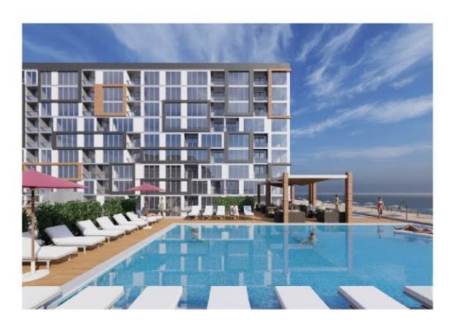
Engel Burman at the Beach Rendering

Camoin 310 was commissioned by the Nassau County IDA to provide an economic impact study to estimate the number of new jobs and household spending generated by the project. Camoin 310 uses an input-output model to determine the economic impact as designed by the Economic Modeling Specialists, International (EMSI). Direct economic activity inputs (Jobs and Spending) are used to model the spillover effect of spending in the local economy. Camoin 310 reports the following Direct, Indirect, and Induced impacts as follows: